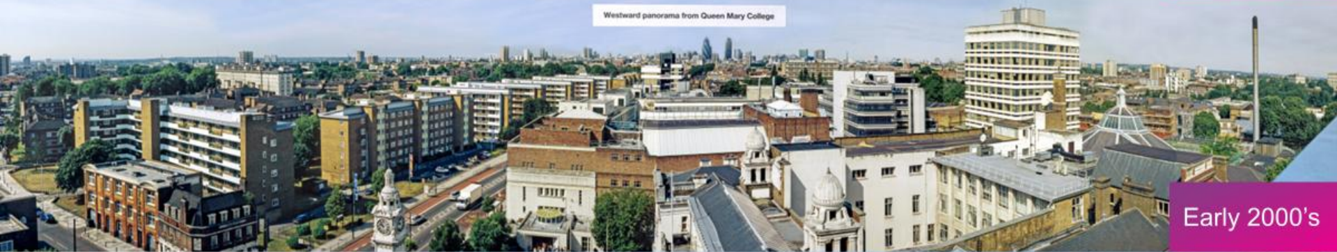
Westward panorama from Queen Mary College